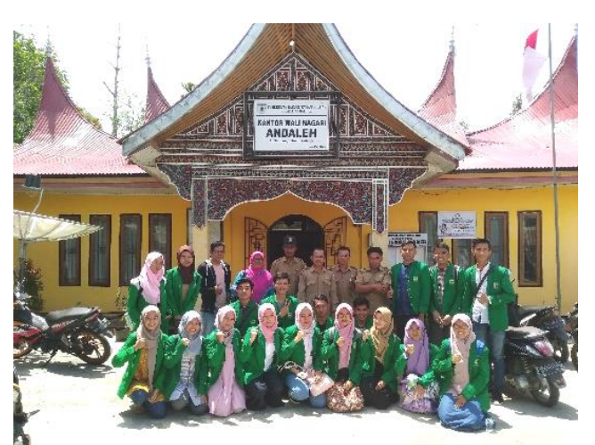
Figure 1. An official photo at the Wali Nagari Andaleh Office

Students who have been selected from various study programs and faculties at Andalas University are 25 people. Debriefing was carried out by the Andalas University Team and the Implementation Team. Before students are dispatched or deployed to the field, a field survey is carried out in Nagari Andaleh. After the meeting with Wali Nagari and Nagari devices in the Wali Nagari office we took a picture together with the Nagari local government officials in front of Wali Nagari's office Figure 1.